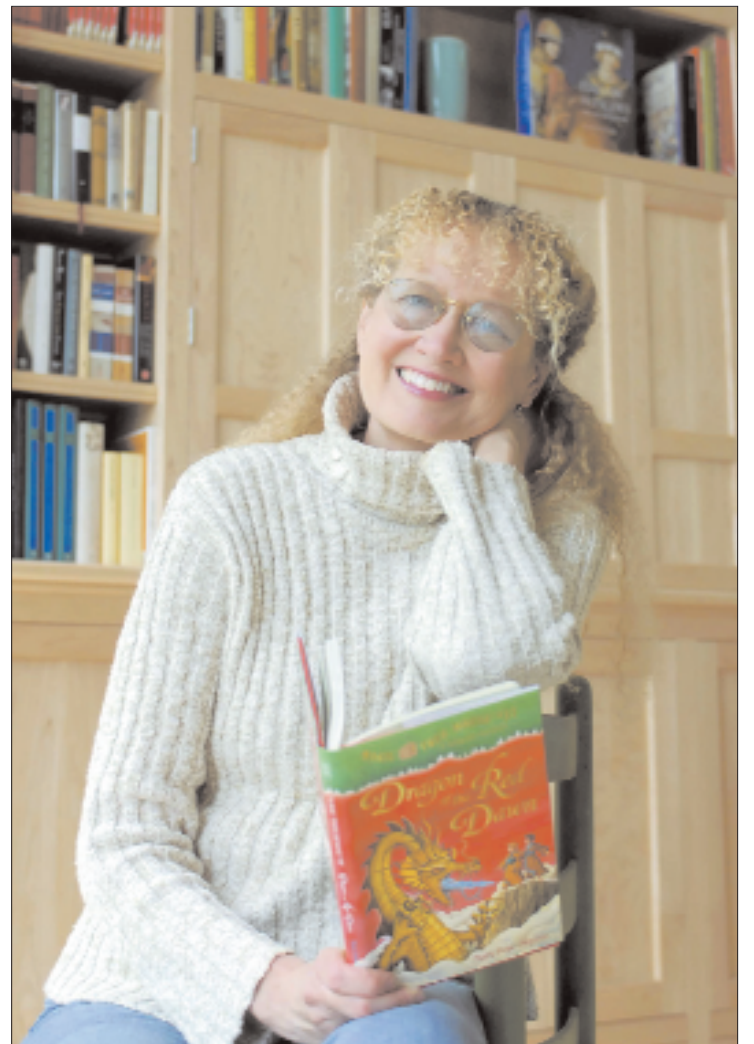
Mary Pope Osborne, author of the best selling "Magic Tree House" series children's books, poses for a photograph at her home in Goshen, Conn.

NEW YORK (AP) — Pulitzer Prize-winning journalist and historian Rick Atkinson has received a